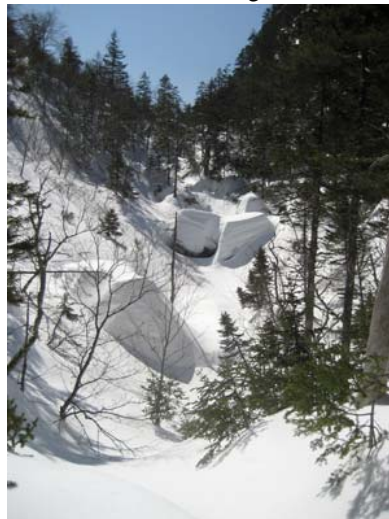
seracs, New England style