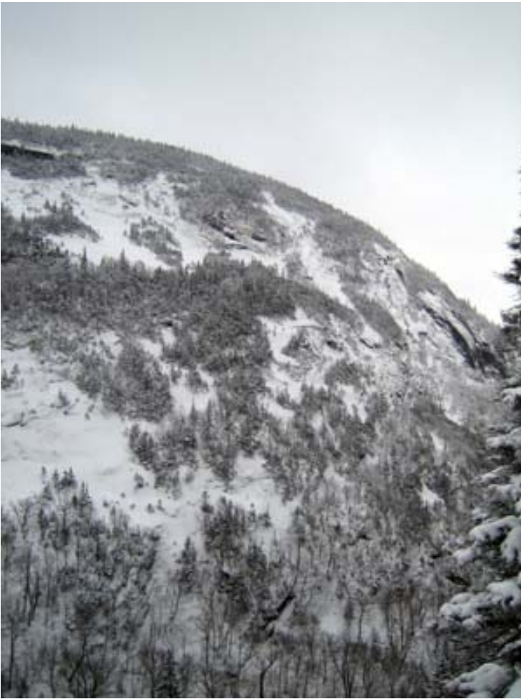
thules, right half, and the main wall