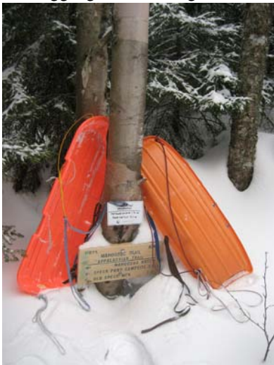
access hint: consider a sled

There are two ways to get to Mahoosuc Notch in the winter, neither of them easy. Either take the Success Pond Road (if passable) from Berlin, NH to the Notch Trail and hike to the upper (SW) Notch; or, drive past Sunday River to Ketchum, Maine, and hike several miles NW (then SW) on old logging roads along Bull Run Creek to bushwhacking at the NE end of the Notch.