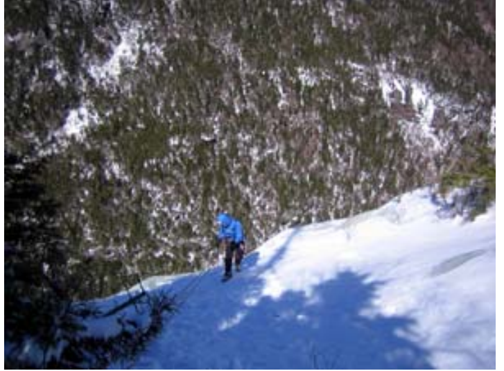
Jim rappeling the long climb at the left end of the main wall; lower sunnyside is just visible in the trees at the right; the 100 foot cliffs of center sunnyside are prominent on the right, and upper sunnyside is the white patch on the left.