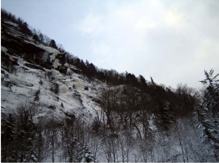
the left end of the Berlin Wall from the AT