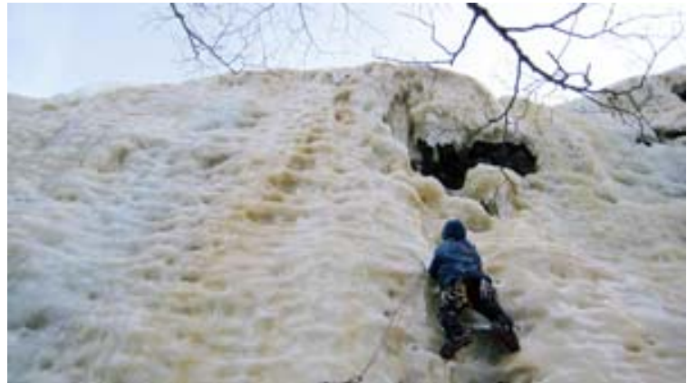
Dave on the center thules wall