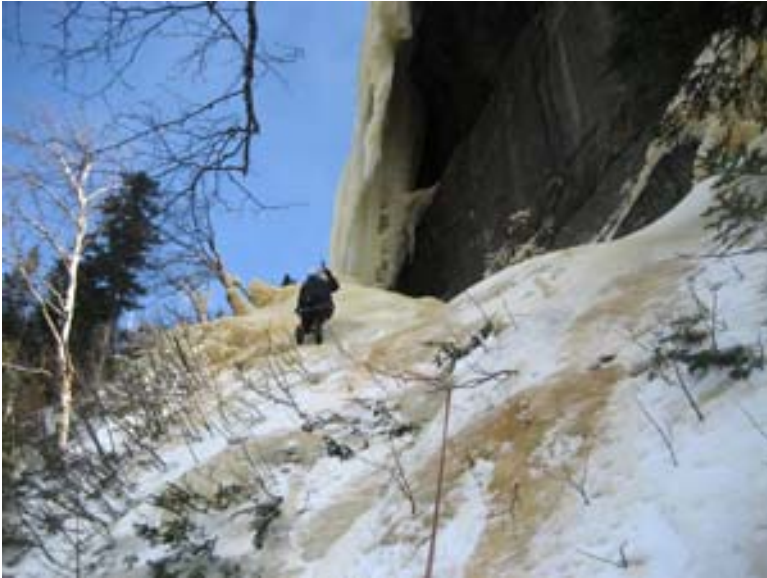
Jim approaching the yellow cave in the center of the upper thules