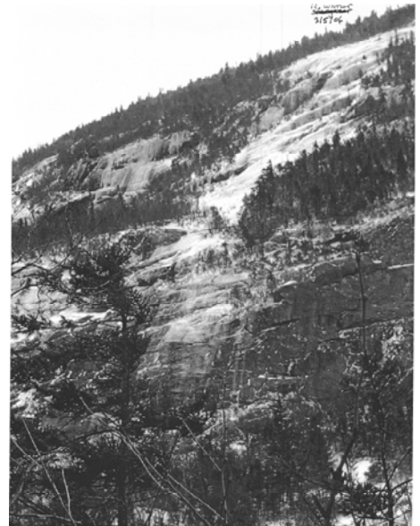
the long climb at the left of the main wall