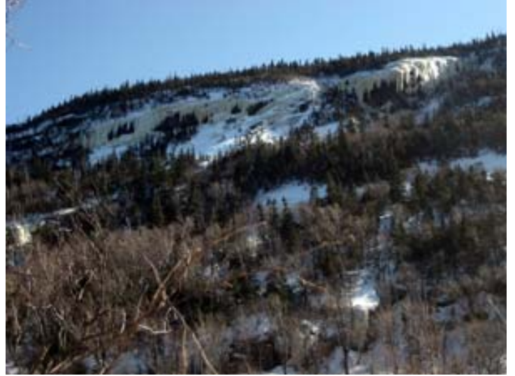
thules, left half; thin slabs visible in the trees lead to the upper cliff band