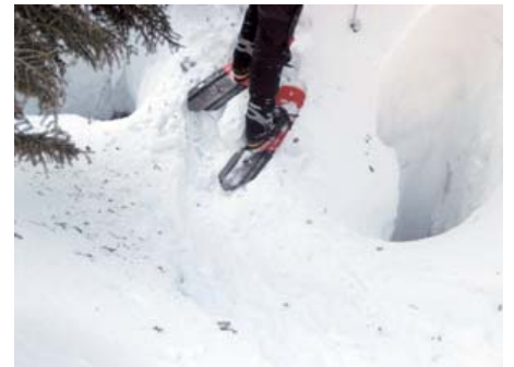
crevasses & snow bridges, New England style